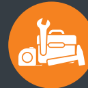
Craft hobby and non industrial users